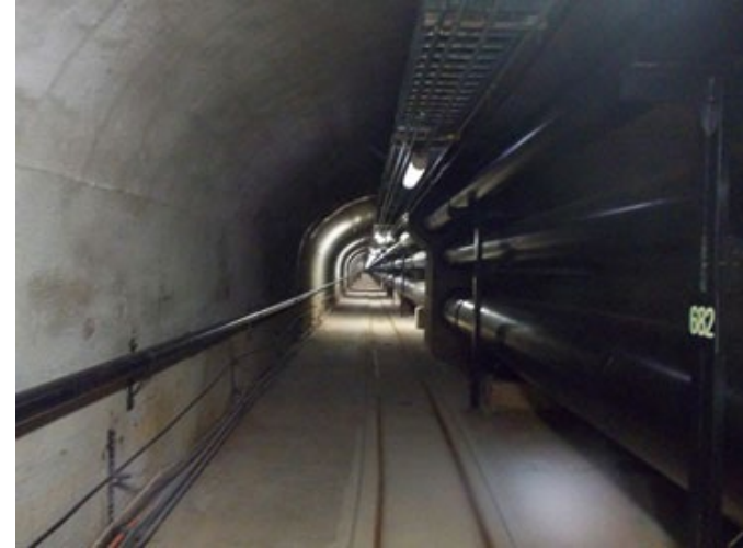
Red Hill Bulk Fuel Storage Facility.