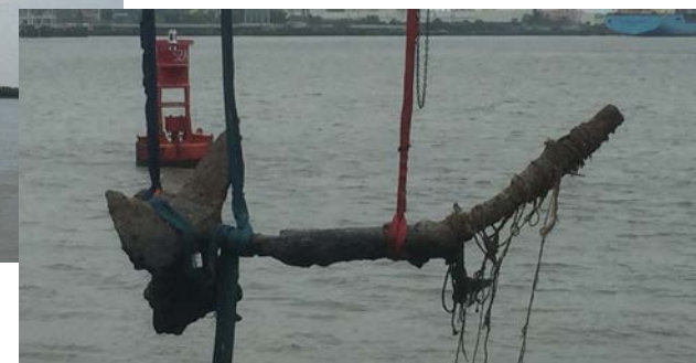
Propeller and shaft lift