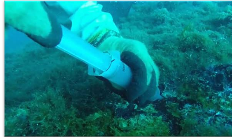
Tank sampling – Dec 16