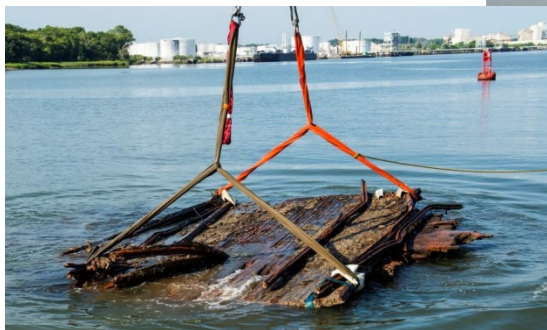
Section of casement emerging from Savannah River