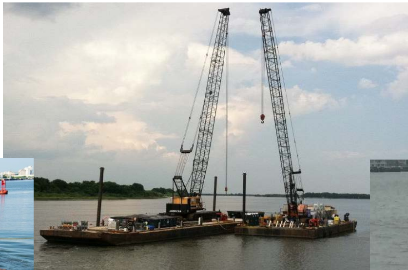
Summer 2016 dive and work barges