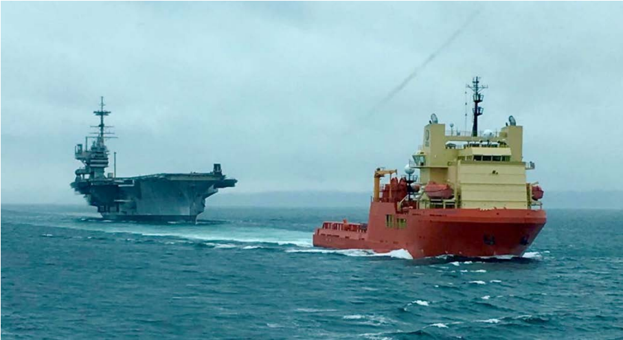
INDEPENDENCE under tow leaving Bremerton