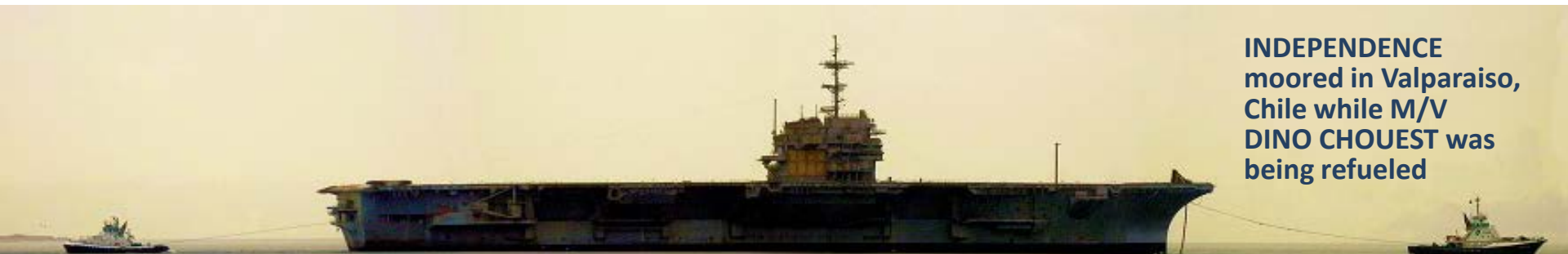
INDEPENDENCE moored in Valparaiso, Chile while M/V DINO CHOUEST was being refueled