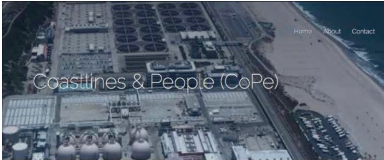
Coastlines & People (CoPe)